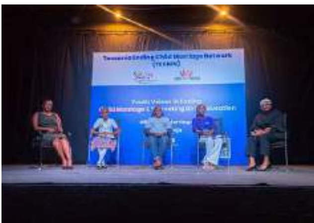
Panelist during TECMN Youth Forum

The training connected participants with health and social work experts, equipping them with knowledge of their rights, where to report abuse, and the confidence to stay in school..